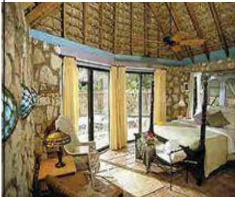
Cottage on the beach at Fernandez Bay Village with a garden shower

24 hotel rooms & 14 cottages on the famous pink sand beach at the edge of 200y old Dunmore Town. Facilities include Terrace restaurant with ocean view, Beach Bar restaurant, fresh water swimming pool, free tennis, complimentary use of kayaks & snorkeling gear, game room with cable TV, library and games. Boat rental, scuba diving (off property), bicycle & golf cart rentals available nearby. The Newly Built Standard Ocean View Rooms With signature interiors by Barbara Hulanicki, these rooms provide spectacular views of the ocean, as well as balconies and oversized bathrooms with a walk-in shower. King bed. Max 2 Persons. 400 Sq Ft. (Junior Suite offered as substitute if non availability in the ocean view at same cost) Enjoy the native life with the locals. Stroll through the town and try a fresh conch salad and visit the straw vendors on Bay street.