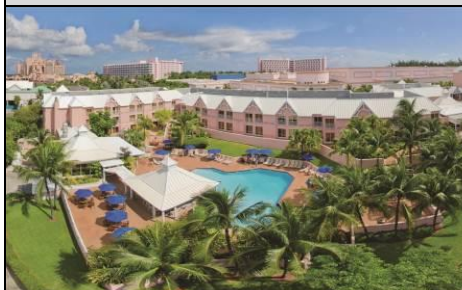
Comfort Suites, Paradise Island