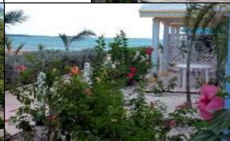
Hideaways at Palm Bay Beach Club

Location: Center of Paradise Island, 288 one room junior suites. Full use of ALL facilities at Atlantis resort, such as water park, beach, pools, dolphin cay, lazy river ride, Atlantis kids camp, and signing privileges to over 24 restaurants, snack bars, bars and casino. Junior Suites have 2 double or king bed, cable TV, in-room safe, phone with data ports, hairdryer.